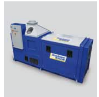
StyroPress® without shredder