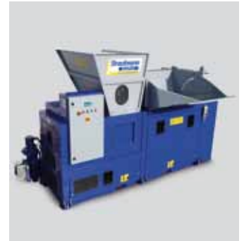
StyroPress® with shredder