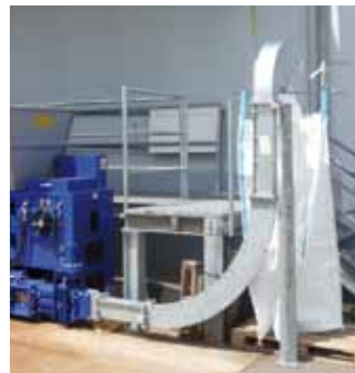
Discharging tunnel (optional)